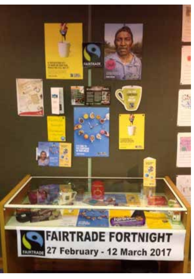
The Fairtrade display in Lochthorn Library, Dumfries

Young people celebrated Fairtrade Fortnight in schools across Dumfries and Galloway.