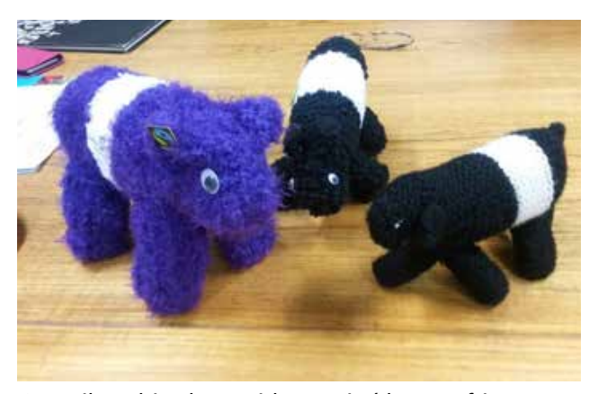
Council's Beltie along with Doonie (the Dumfries Beltie) and Dougie (the Castle Douglas Beltie).

For a bit of fun the local Fairtrade Groups have been making Fairtrade Belted Galloway cows for each town and village that has Fairtrade status. There is Dougie (Castle Douglas), Doonie