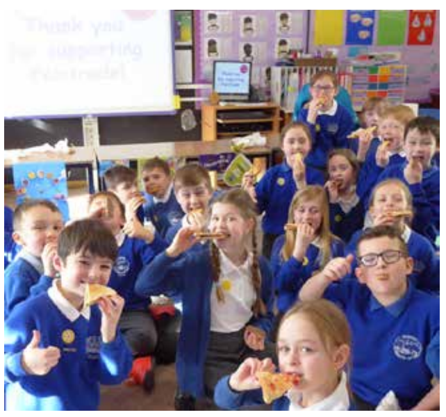
Pupils at Dalbeattie Primary School enjoying a Fairtrade snack!