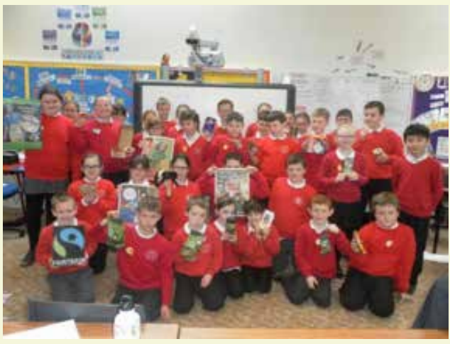
Pupils at Twynholm Primary School