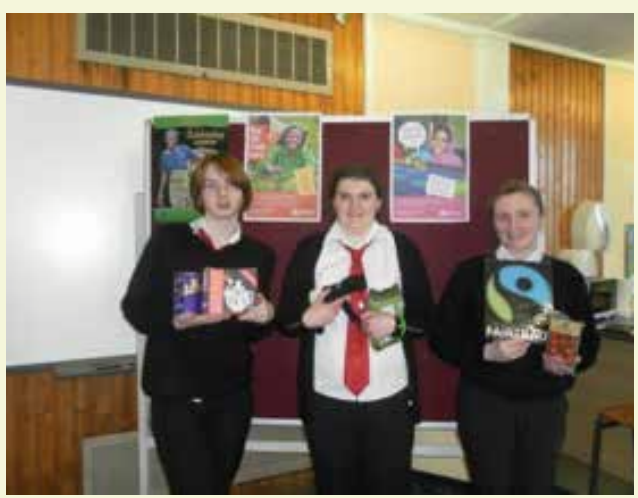
Pupils at Kirkcudbright Academy