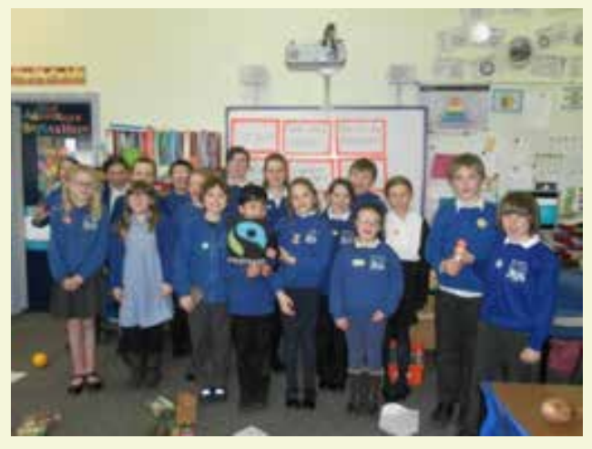
Pupils at Borgue Primary School

Representatives from Kirkcudbright Fairtrade Group visited Auchencairn, Borgue, Dalbeattie, Gatehouse, Kirkcudbright and Twynholm Primary Schools. They also visited Dalbeattie High School and Kirkcudbright Academy. They engaged pupils in learning about Fairtrade using talks, films, songs and an activity in which pupils planned and presented a mock radio interview and jingle!