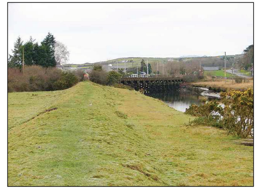
TYPICAL EXAMPLE OF EMBANKMENT