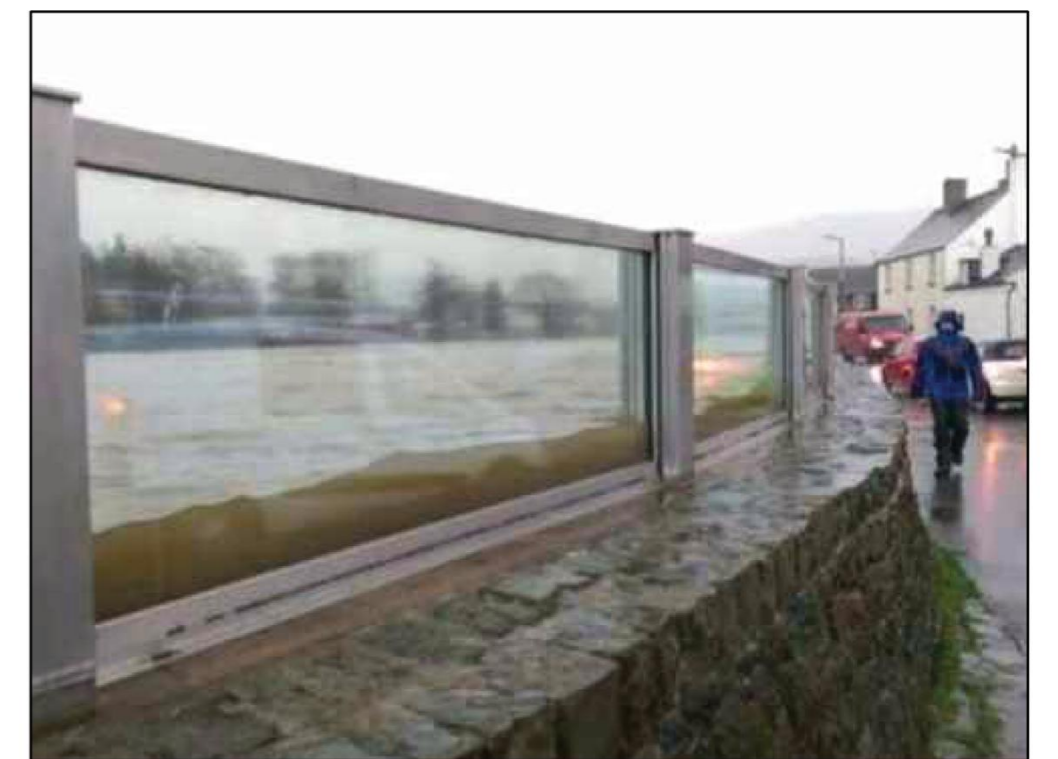
EXAMPLE OF EXISTING STONE WALL WITH TOP MOUNTED GLASS AND STAINLESS STEEL FLOOD PROTECTION (RIVER GRETA, KESWICK)