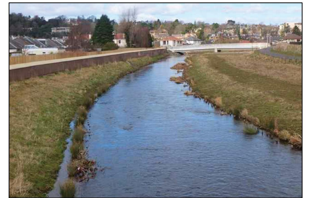
TYPICAL EXAMPLE OF BRICK FACED WALL (WATER OF LEITH, EDINBURGH)