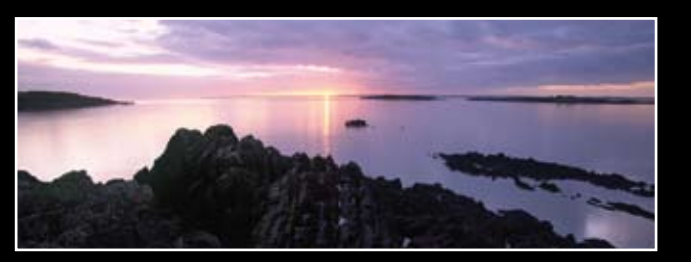
Knockbrex Hill Viewpoint