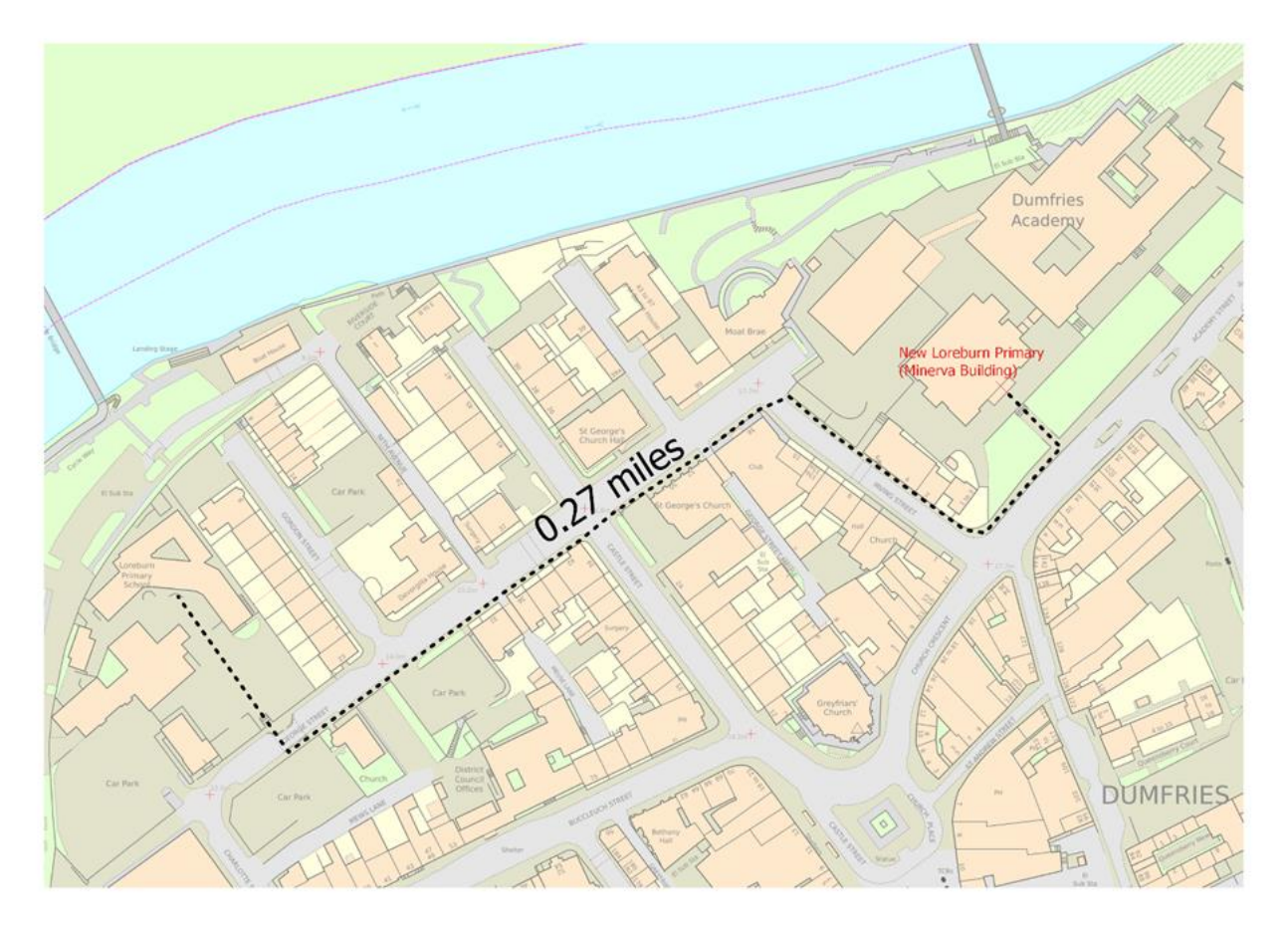
Distance between main entrance of Loreburn Primary and Dumfries Academy