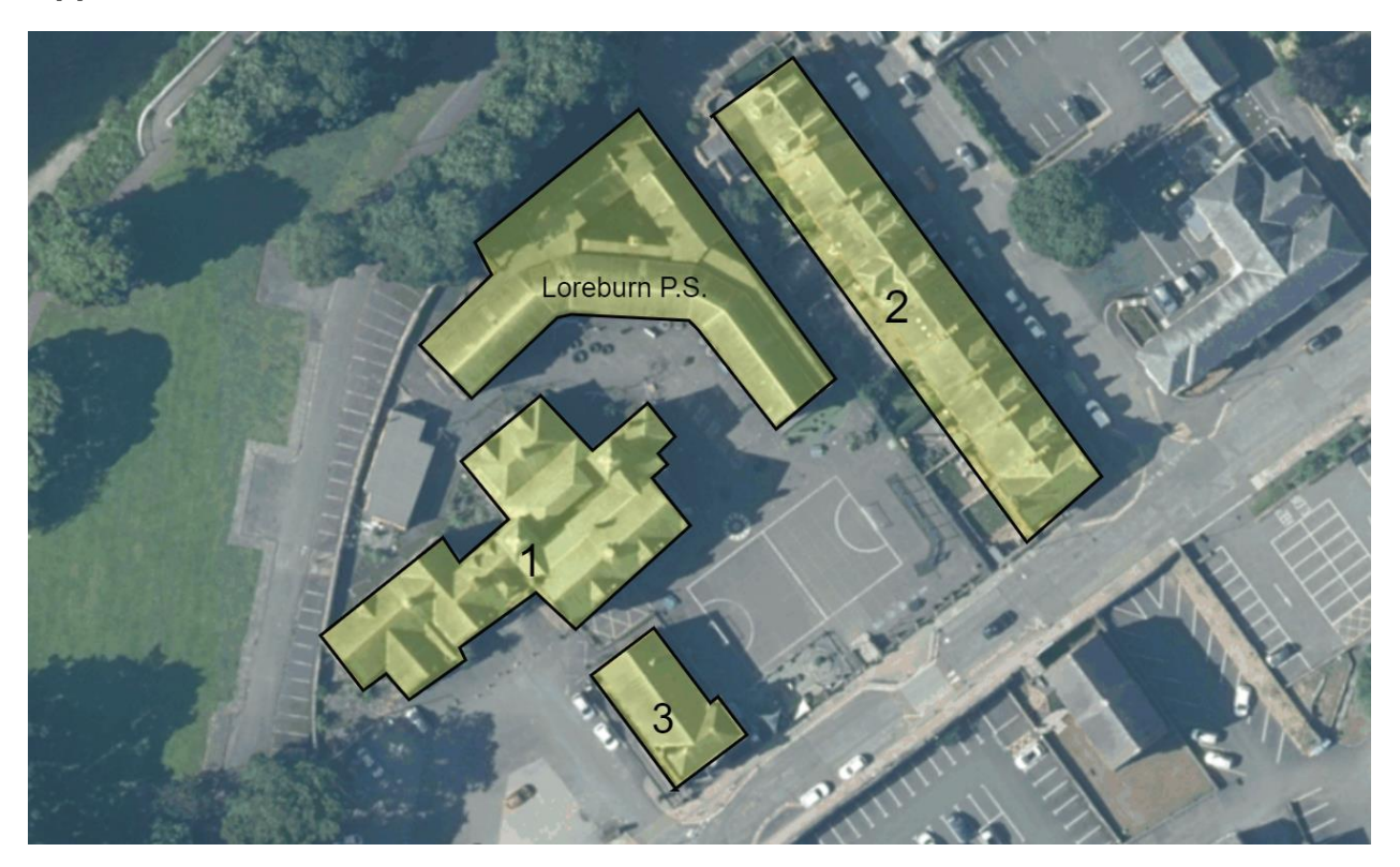
Loreburn Primary School in relation to 1. School of Art 2. Housing 3. Playworks Nursery