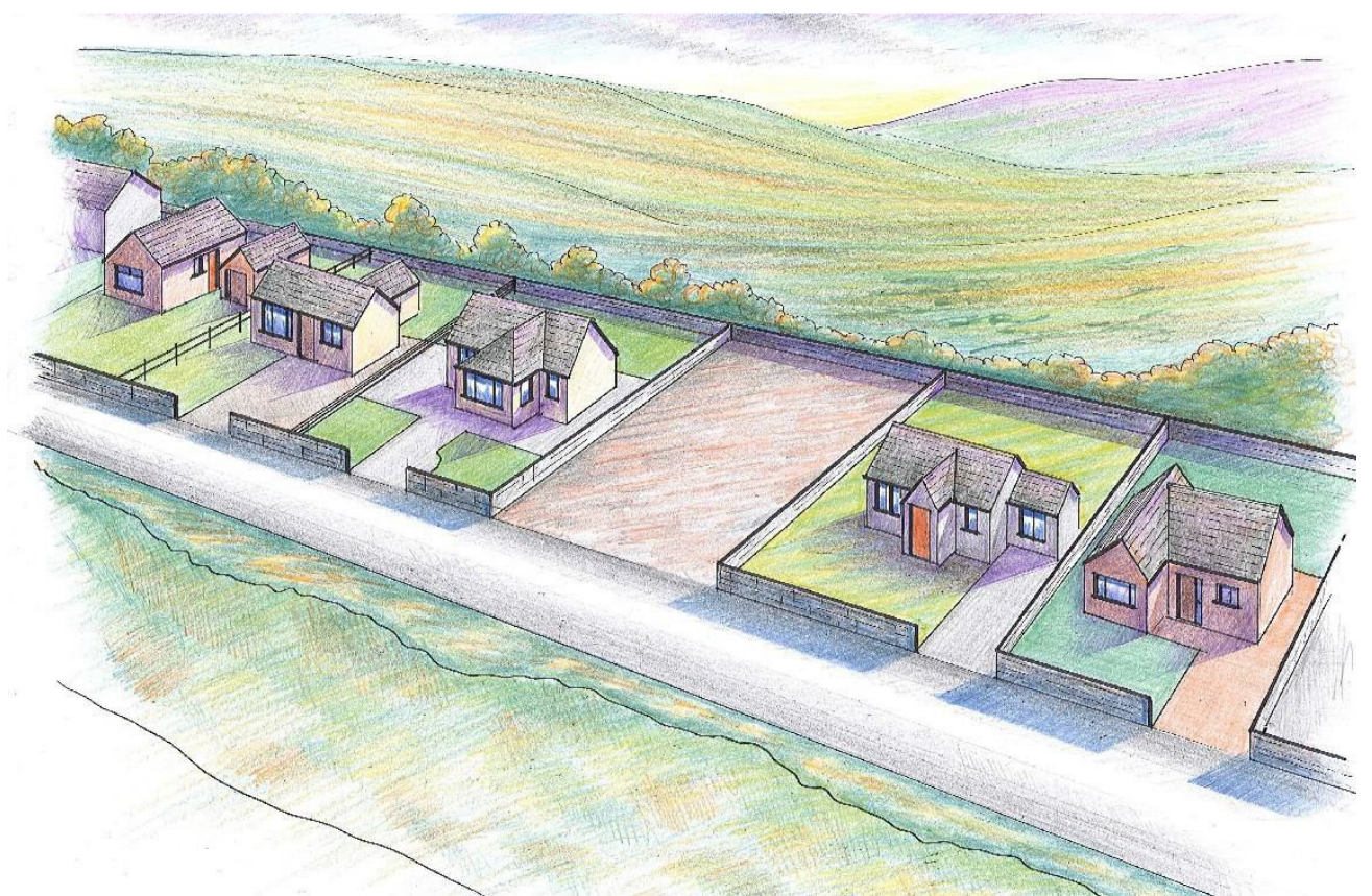
Example of an appropriate edge of village site: small field adjacent to the existing settlement edge naturally contained by an established boundary