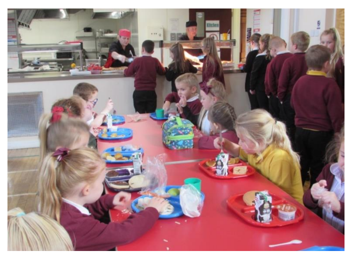
Free School Meals

All Children with allergens should register with the catering team as soon as they are aware that their child has an allergen or intolerance to food.