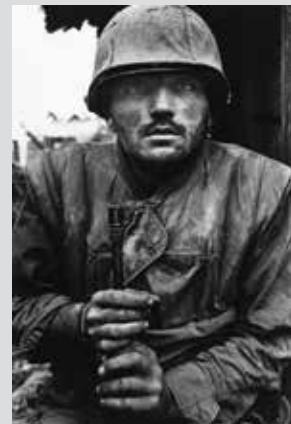
Don McCullin Shell-shocked US Marine, The Battle of Hue 1968 (printed 2013). ARTIST ROOMS National Galleries of Scotland and Tate. Presented by the artist 2014